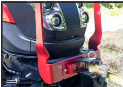
FRONT TOW HOOK