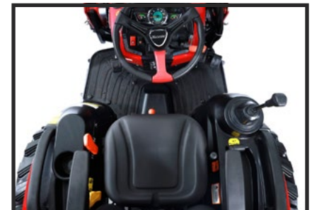
PREMIUM SEAT WITH ARM RESTS