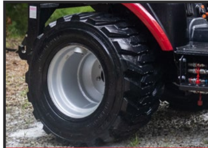
R3, R4, R14 TIRE CHOICES