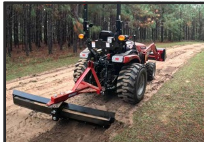
REAR BLADE GRADING & LEVELING