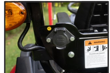
7-PIN TRAILER CONNECTOR