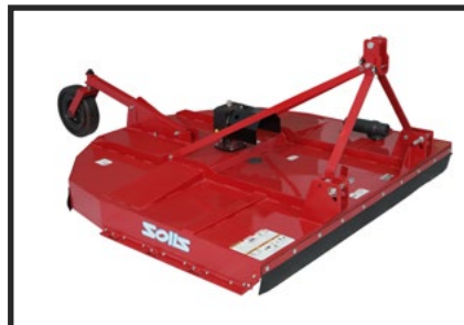
ROTARY CUTTER WEEDS & BRUSH