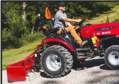
BOX BLADE LEVELING & GRADING