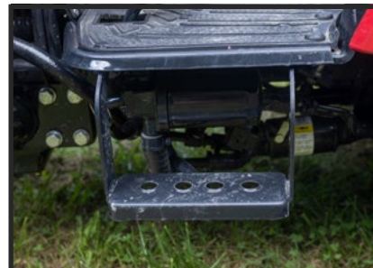
ENTRY STEPS BOTH SIDES