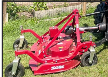
FINISH MOWER LAWN CARE