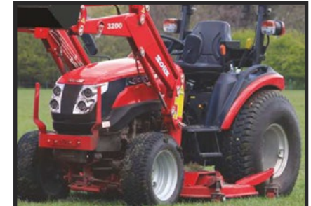
MID-MOUNT MOWER MOWING GRASS