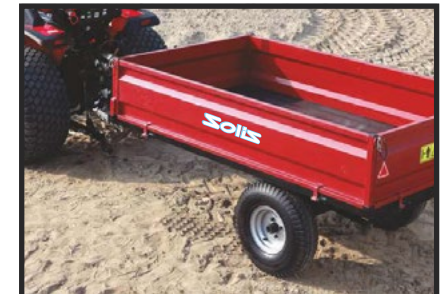
TRAILERS LOADING & HAULING