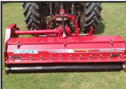
FLAIL MOWER CLEAR THICK BRUSH