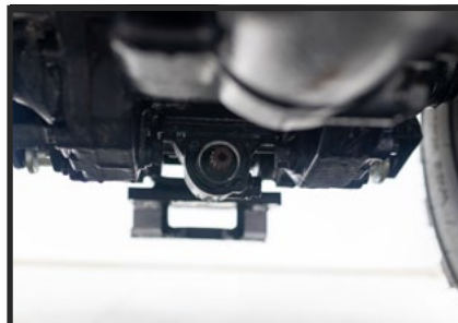
STANDARD MID PTO FOR BELLY MOWER