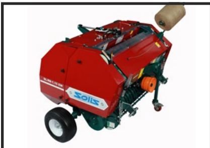
ROUND BALER BAILING HAY