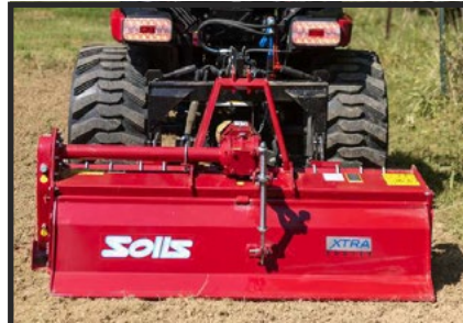
ROTARY TILLER FIELD PREPARATION