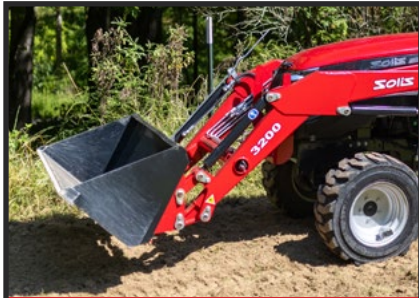
SELF-LEVELING FRONT-END LOADER