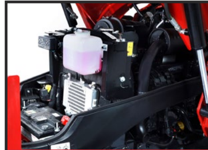
3 CYLINDER MITSUBISHI ENGINE