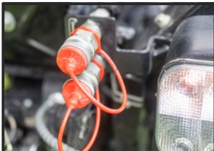
STANDARD REAR REMOTES