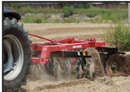
DISC HARROW FIELD PREPARATION